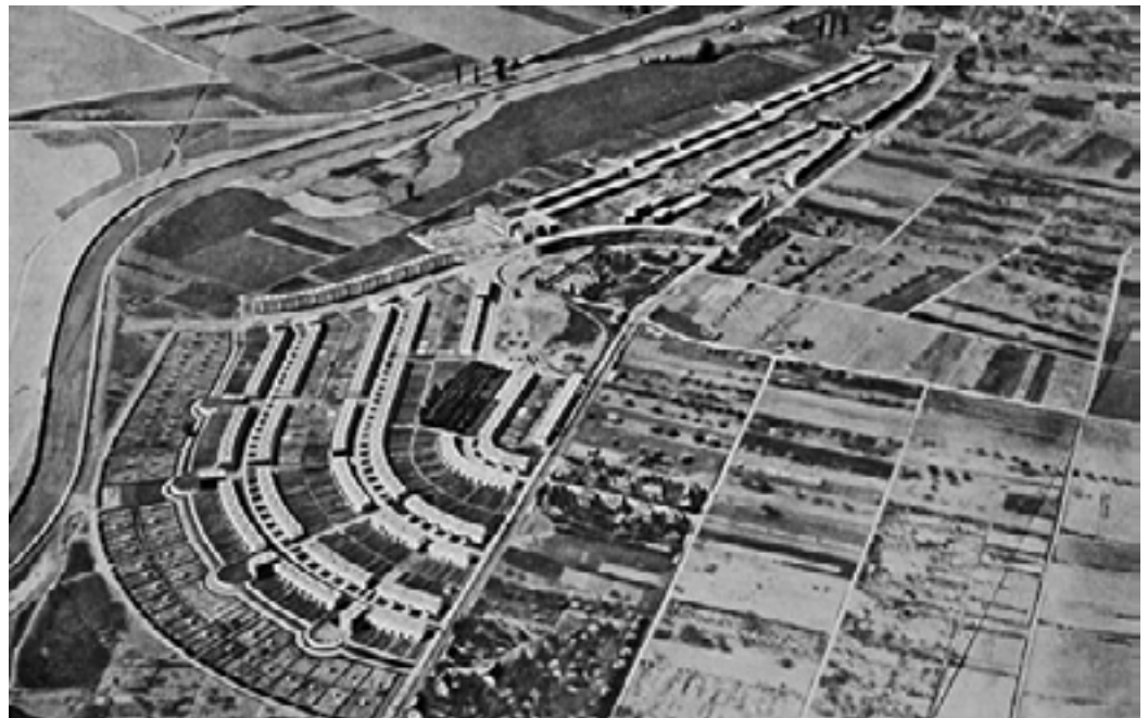
Fig.: Historica aerial view of the Römerstadt settlement around 1930, ca. 1930

In addition to contributions from architectural history and the field of heritage preservation, the event will also be deepened with positions from art, film and music, and supplemented by student works related to digitization and documentation.