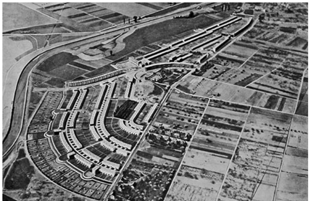
Fig.: Historica aerial view of the Römerstadt settlement around 1930, ca. 1930

In addition to contributions from architectural history and the field of heritage preservation, the event will also be deepened with positions from art, film and music, and supplemented by student works related to digitization and documentation.