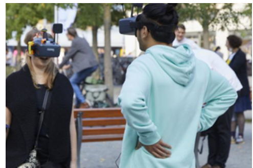
Agentur des städtischen Wandels, Braubachstrasse Aktionstag Post-Corona-Innenstadt Frankfurt