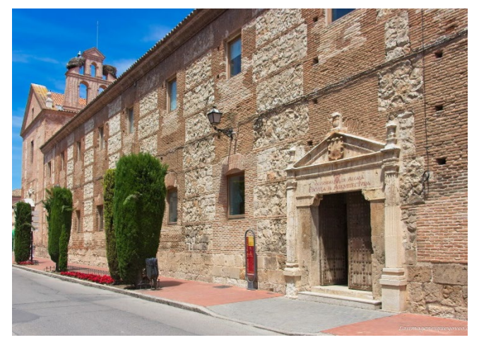
Architecture school. A<u>lcalá</u> University. C/ Santa Úrsula 8; Alcalá de Henares.

Monday 4 to Thursday 7, October 2021 / Alcalá University & Polytechnic University of Madrid.