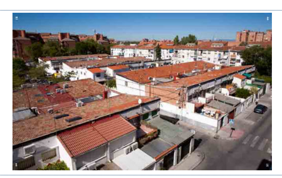
Orcasur Neighborhood (1970's)