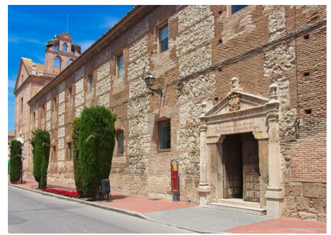
Architecture school. A<u>lcalá</u> University. C/ Santa Úrsula 8; Alcalá de Henares.

Monday 4 to Thursday 7, October 2021 / Alcalá University & Polytechnic University of Madrid.