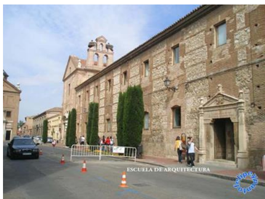
Architecture school. University of Alcalá. C/ Santa Úrsula 8; Alcalá de Henares.