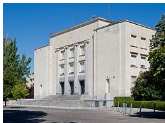
Architecture school. Polytechnic University of Madrid. Avenida Juan Herrera, 4; Madrid